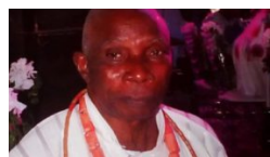
Ogiamien in Journey Through Time 2 days ago Read More

Tinubu speaks on rumour of presidential bid 2 days ago