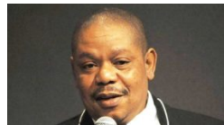
Eko International Film Festival begins tomorrow